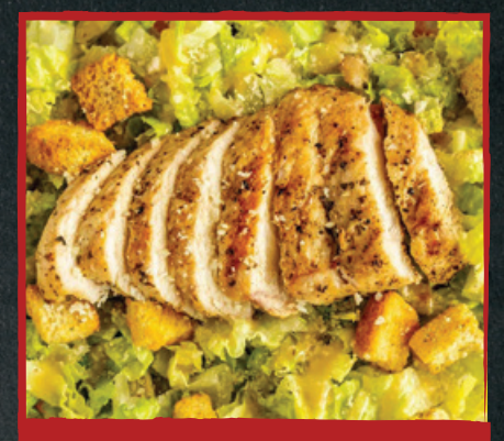
Romaine lettuce, homemade croutons, grated parmesan cheese and creamy Caesar dressing

Tomatoes, cucumbers, red onions, banana peppers, black olives, pickles, croutons, ham, salami, pepperoni & provolone cheese on a bed of lettuce